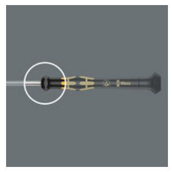
The precision zone directly above the blade gives the user a better feel for the right rotation angle during fine adjustment work.