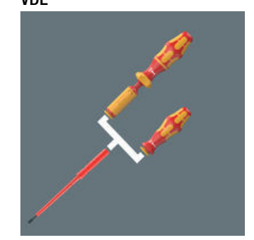
Suitable for Kraftform handles 7400 VDE and 817 VDE .