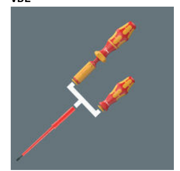
Suitable for Kraftform handles 7400 VDE and 817 VDE .

Handle/interchangeable blade system – Kraftform Kompakt VDE