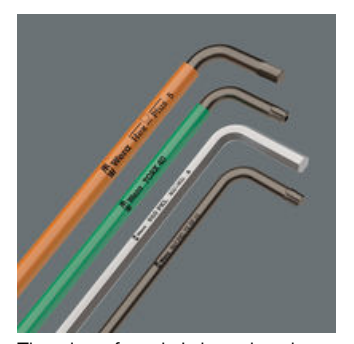
The size of each L-keys has been engraved by a laser. In addition SPKL L-keys have a colour coding according to sizes – for simple and rapid accessing of the required tool. Making it easy to find the right tool.