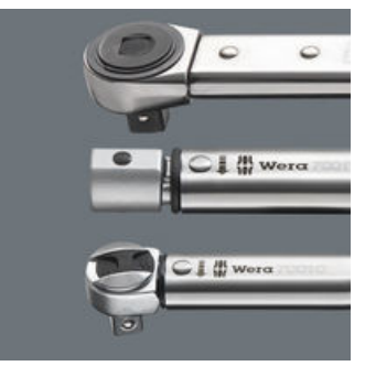
Reversible ratchet, push through ratchet or fitting for interchangeable insert tools.