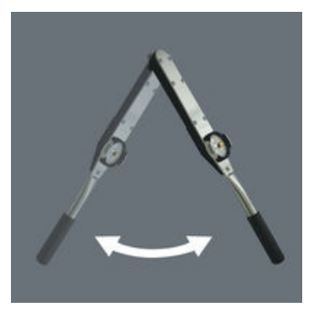
Suitable for right and left-hand direction.