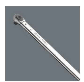
Range up to 1300 Nm.