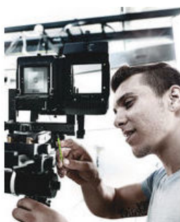
Holding function for recessed TORX® screws