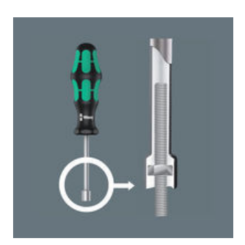
A screwdriver with a hollow shaft is needed whenever there are screwdriving jobs involving threaded rods i.e. the threaded rod through the nut can slip into the hollow shaft of the screwdriver.

Handle/interchangeable blade system – Kraftform Kompakt VDE