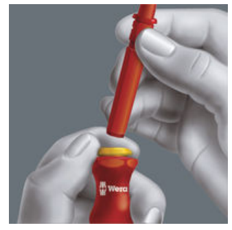
The handle/interchangeable blade system allows rapid exchange of the blades required for a wide range of applications.

Handle/interchangeable blade system – Kraftform Kompakt VDE