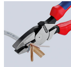
Long cutting edges for cutting flat cables