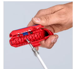
Stripping of a coax cable