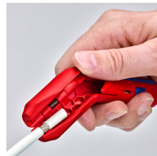
stripping of a coax cable