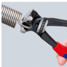
Extraordinary cutting performance: also for piano wire