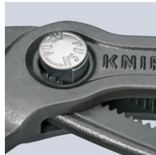
Fine adjustment by pushing a button: fast and comfortable.