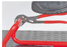
Teeth set against the direction of rotation have a self-locking effect and prevent slipping on the workpiece.