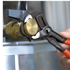
Fast and firm adjustment directly on the workpiece