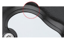
Precision milled and induction hardened cutting edge