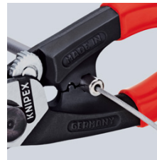
Crimping of the end caps on the Bowden cable sheath