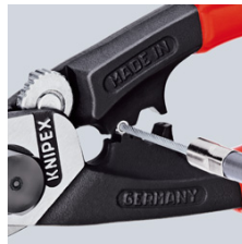
Crimping of the end ferrule onto the traction cable