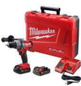
M18 FUEL™ 1/2" Hammer Drill/Driver Kit

(/Products/Power- Tools/Drilling/Drill- Drivers/2603-22CT)