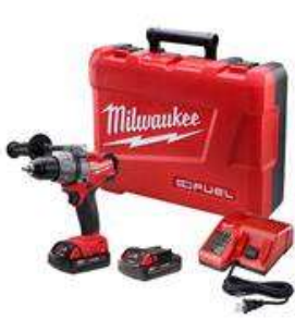
M18 FUEL™ 1/2" Drill/Driver Kit

(/Products/Power- Tools/Drilling/Drill- Drivers/2603-22CT)