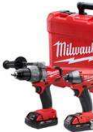
M18 FUEL™ LIT 2-Tool Combo Ki

(/Products/Power- Tools/Drilling/Hammer- Drills/2604-22CT)