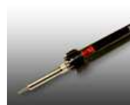
Tools & Accessories