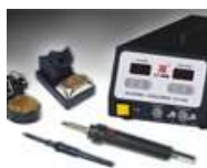
Soldering/Desolder Multi Stations