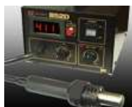
Hot Air & Infrared Rework Stations