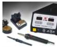
Soldering/Desolder Multi Stations