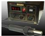
Hot Air & Infrared Rework Stations