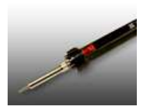
Tools & Accessories