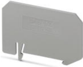
Partition plate, length: 64.4 mm, width: 2 mm, height: 46 mm, color: gray

Please be informed that the data shown in this PDF Document is generated from our Online Catalog. Please find the complete data in the user's documentation. Our General Terms of Use for Downloads are valid ( http://phoenixcontact.com/download )