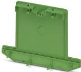
Side element, tall version, for closing both ends of the base element UM-BEFE, for 73 mm wide U-shaped profile cover

Please be informed that the data shown in this PDF Document is generated from our Online Catalog. Please find the complete data in the user's documentation. Our General Terms of Use for Downloads are valid ( http://phoenixcontact.com/download )