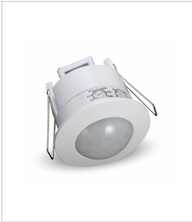
VT-8051 PIR CEILING SENSOR-WHITE