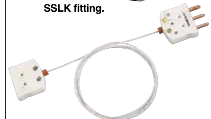
TECU10-MTP extension cable.