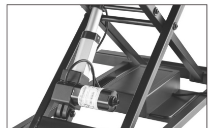
Powerful Motor Allows for stable height adjustment