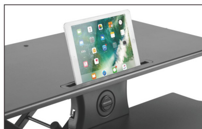
Open Storage Slot For tablets or phones