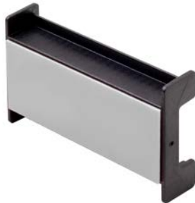
Self-adhesive tape mounting Initial adhesive power is 40% and 1.1 lbs after 24hrs