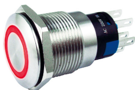
Flush Illuminated Vandal Resistant Switch