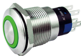
Domed Illuminated Vandal Resistant Switch