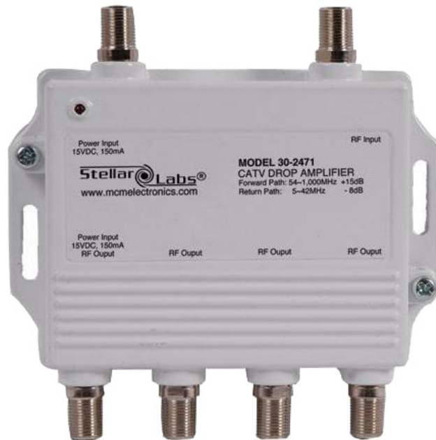
Part Number: 30-2471