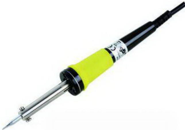
25W Soldering Iron Model: D03286