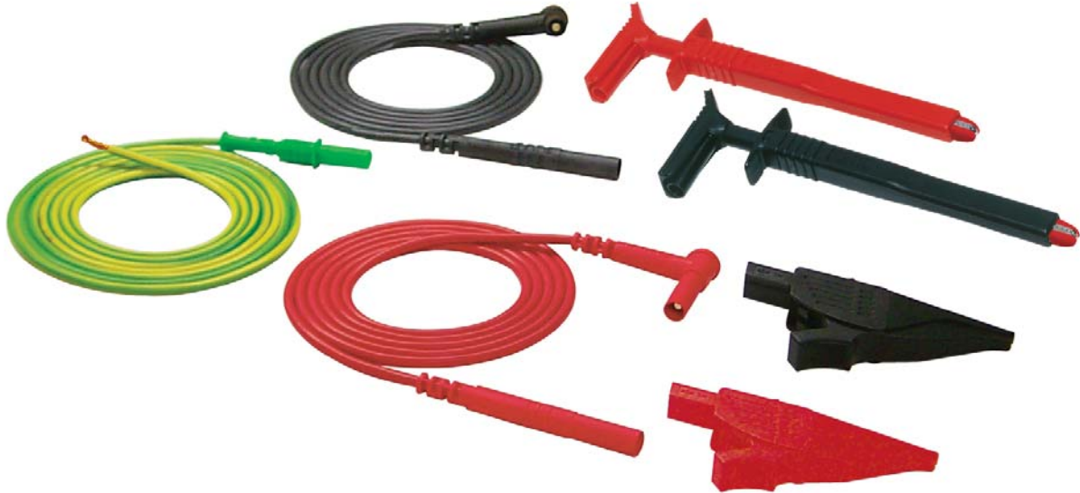
Optional Lead Set includes: two color-coded leads, one ground lead (stripped), two alligator clips, and two grip probes Catalog #2117.78