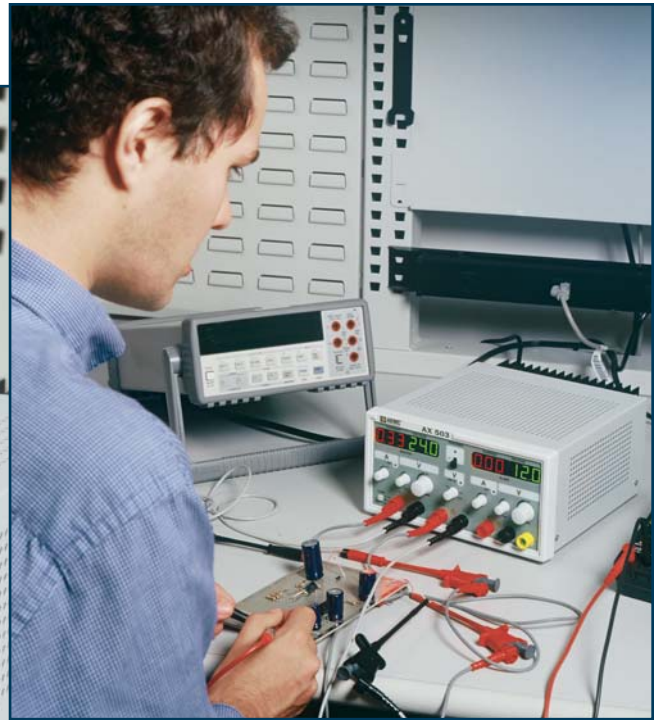
Circuit board design testing using the 30V and 5Vdc outputs