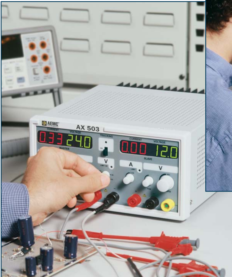
Voltage levels and current limits are easily adjustable from the front panel.