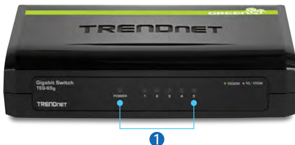
1 LED indicators