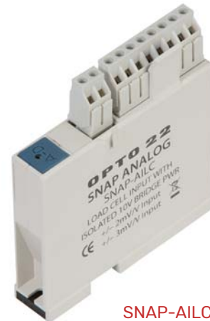
SNAP-AILC Load Cell Module