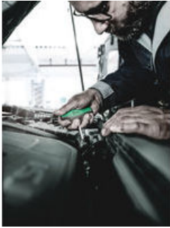
Screwdrivers with T-handle