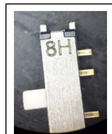
Example of laser marking