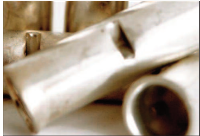
Copper Tube Butt Splices.