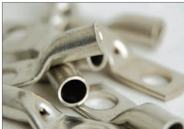
Copper Tube Terminals.