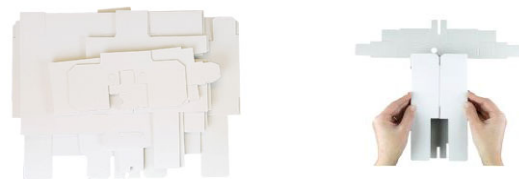
Card robot parts