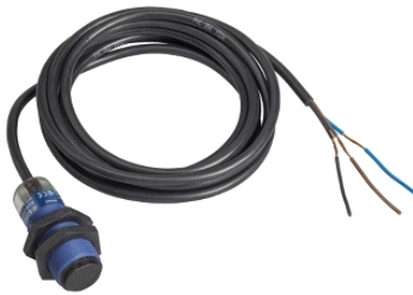
photo-electric sensor - XUB - receiver - Sn 15m - 12..24VDC - cable 2m