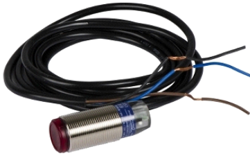
photo-electric sensor - XUB - receiver - Sn 15m - 12..24VDC - cable 2m