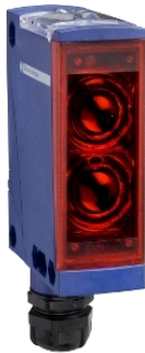
photo-electric sensor - XUX - receiver - Sn 40m - 24..240VAC/DC - terminals