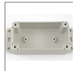
Internal DIN rail mounting point.