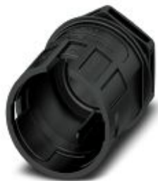
Circular connectors (device-side), Device connector, front mounting, housing material: PPE, color: black, nom. voltage: 690 V AC

Please be informed that the data shown in this PDF Document is generated from our Online Catalog. Please find the complete data in the user's documentation. Our General Terms of Use for Downloads are valid ( http://phoenixcontact.com/download )