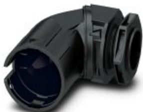
Circular connectors (device-side), Device connector, front mounting, housing material: PPE, color: black, nom. voltage: 690 V AC

Please be informed that the data shown in this PDF Document is generated from our Online Catalog. Please find the complete data in the user's documentation. Our General Terms of Use for Downloads are valid ( http://phoenixcontact.com/download )