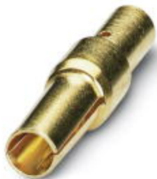
Crimp contact, turned, Single contact, contact diameter: 1 mm, crimp range: 0.08 mm 2 ... 0.22 mm 2

Please be informed that the data shown in this PDF Document is generated from our Online Catalog. Please find the complete data in the user's documentation. Our General Terms of Use for Downloads are valid ( http://phoenixcontact.com/download )