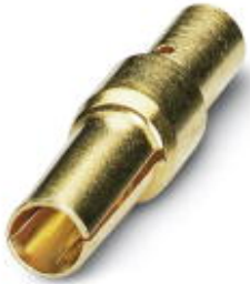
Crimp contact, turned, Single contact, contact diameter: 1 mm, crimp range: 0.14 mm 2 ... 0.56 mm 2

Please be informed that the data shown in this PDF Document is generated from our Online Catalog. Please find the complete data in the user's documentation. Our General Terms of Use for Downloads are valid ( http://phoenixcontact.com/download )