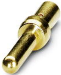
Crimp contact, turned, Single contact, contact diameter: 1 mm, crimp range: 0.5 mm 2 ... 1 mm 2

Please be informed that the data shown in this PDF Document is generated from our Online Catalog. Please find the complete data in the user's documentation. Our General Terms of Use for Downloads are valid ( http://phoenixcontact.com/download )