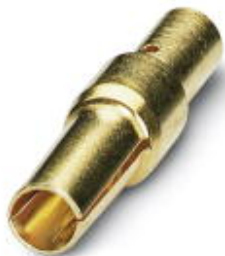
Crimp contact, turned, contact diameter: 2 mm, crimp range: 1.5 mm 2 ... 2.5 mm 2

Please be informed that the data shown in this PDF Document is generated from our Online Catalog. Please find the complete data in the user's documentation. Our General Terms of Use for Downloads are valid ( http://phoenixcontact.com/download )