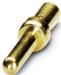
Crimp contact, turned, contact diameter: 2 mm, crimp range: 1 mm 2 ... 1.5 mm 2

Please be informed that the data shown in this PDF Document is generated from our Online Catalog. Please find the complete data in the user's documentation. Our General Terms of Use for Downloads are valid ( http://phoenixcontact.com/download )