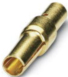
Crimp contact, turned, contact diameter: 2 mm, crimp range: 1 mm 2 ... 1.5 mm 2

Please be informed that the data shown in this PDF Document is generated from our Online Catalog. Please find the complete data in the user's documentation. Our General Terms of Use for Downloads are valid ( http://phoenixcontact.com/download )