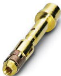
Crimp contact, turned, Single contact, contact diameter: 1 mm, crimp range: 0.06 mm 2 ... 0.25 mm 2

Please be informed that the data shown in this PDF Document is generated from our Online Catalog. Please find the complete data in the user's documentation. Our General Terms of Use for Downloads are valid ( http://phoenixcontact.com/download )