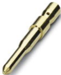
Crimp contact, leading (PE), turned, contact diameter: 1.5 mm, crimp range: 0.5 mm 2 ... 1 mm 2

Please be informed that the data shown in this PDF Document is generated from our Online Catalog. Please find the complete data in the user's documentation. Our General Terms of Use for Downloads are valid ( http://phoenixcontact.com/download )