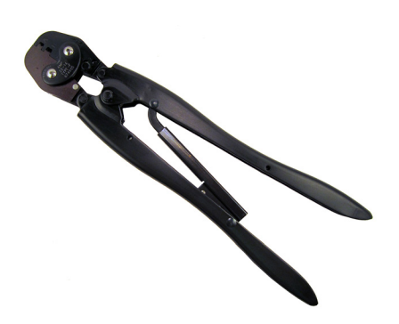
Double Action Hand Tool