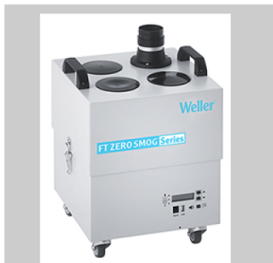
Solder fume extractors