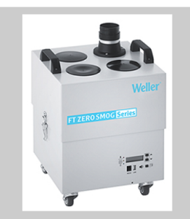
Solder fume extractors