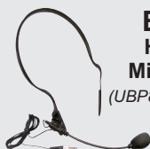
BCHM Headset Microphone (UBP800 Body-Pack required)